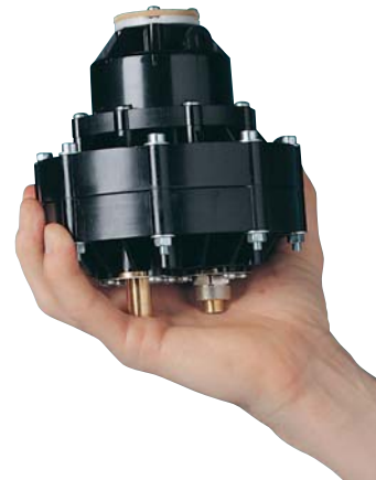
The unique Drester diaphragm pump specifically designed to handle solvent, comes with a 4-year warranty.