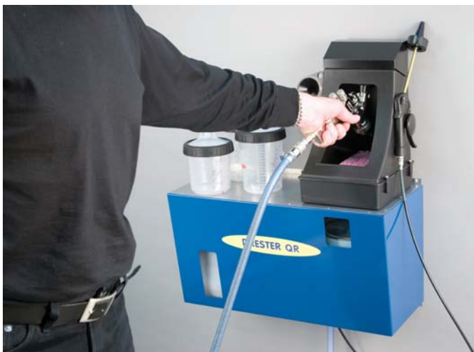
1. Rinse the paint channel