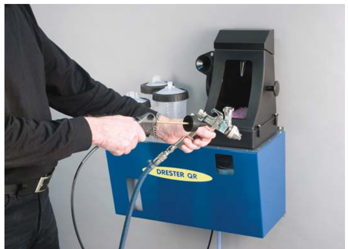
4. Dry the gun