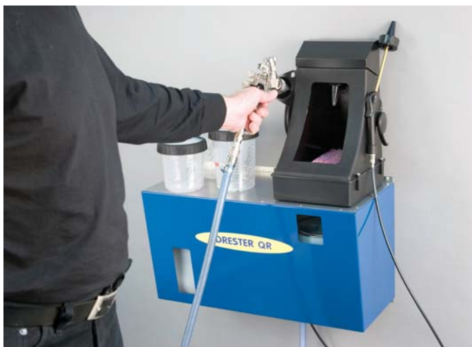
3. Spray out the remains