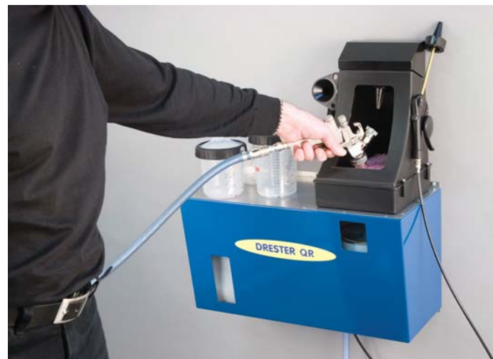
2. Clean the air cap